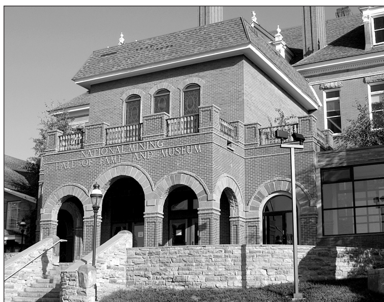
The National Mining Hall of Fame and Museum in Leadville, Colorado will host the 18th Annual MHA Conference, June 7-10, 2007. See inside for details.